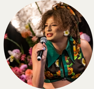
Miss Cairo Cabaret Diva